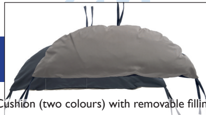
Cushion (two colours) with removable filling